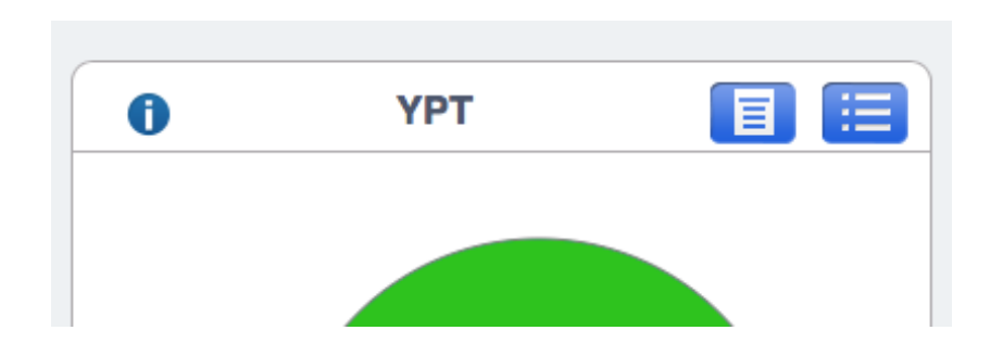
Step 5: Once you click "YPT Aging Report" you will be directed to a page that looks like the one below. The chart beneath lists all of your registered leaders and their status.

Step 4: To the right, above the Youth Protection Chart are two clickable boxes. The one on the right gives you the "YPT Chart Details". This breaks down how many people have their Youth Protection Training and how long until the trainings expire. The left one gives you "YPT Aging Report" (scroll across each to see titles). Click this report to get the details you need for your unit.