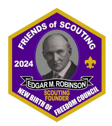
Unit Presenter - Position Description