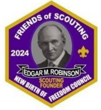
Presenter & Champion Patch